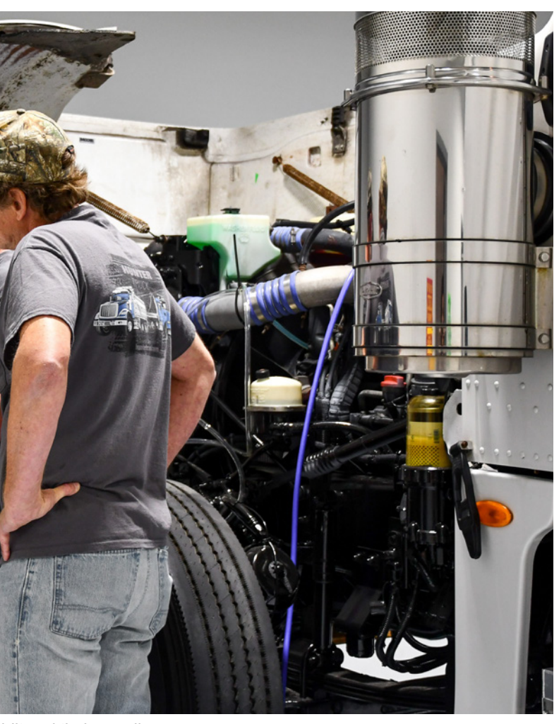
bilt and their suppliers.