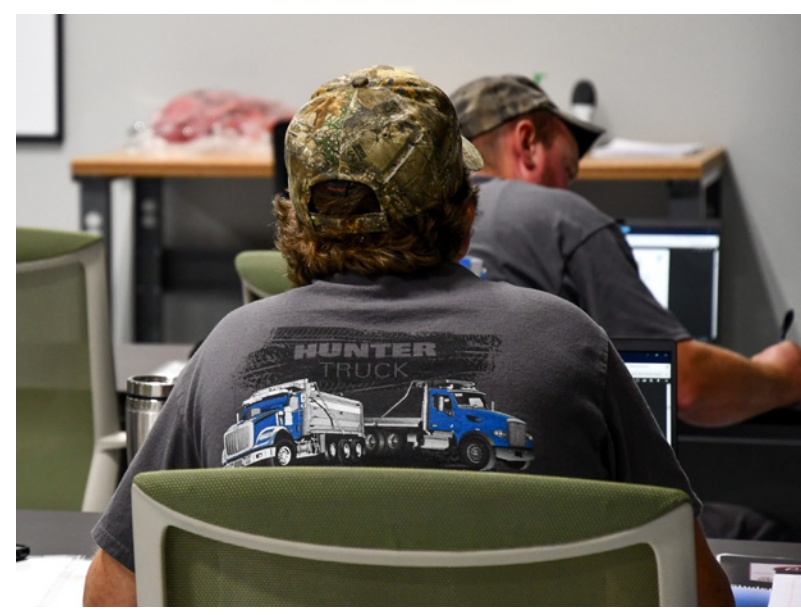
and dedicated department for career development has allowed Hunter Truck to continually improve processes at all of the company's dealerships.

Continued training and development for team members at Hunter Truck is essential to providing excellent service to customers. With 19 locations across 4 states in the northeast, adding this technical training facility