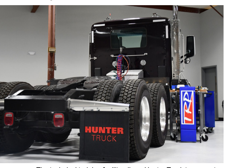
The technical training facility allows Hunter Truck to support it's network of dealerships with process improvement and career development for all technicians.

The Hunter Truck Training Center is located in Butler, Pennsylvania near their dealership and corporate office, approximately 40 miles outside of Pittsburgh, Pennsylvania. The dedicated training facility is 4,225 sq-ft with a combined classroom and shop area. The facility can accommodate up to 25 participants and two trucks. There are also three offices and a break room. The training center is equipped with two complete sets of MX engine tooling, an MX-11 engine on a rotating stand, an MX-13 on a rotating stand, an additional rotating stand used for counter bore cutting classes, 15 computers, a PicoScope with an Noise, Vibration, and Harshness (NVH) adapter kit, a DVA Vibration Analyzer, three toolboxes, one instructor toolbox with specialty tooling, two TRP toolboxes with standard hand tools, three Eaton Endurant Transmissions with adapters mounted on tables, one complete set of Eaton Endurant tooling, and one computer with DAVIE and Service Ranger 4 software installed.