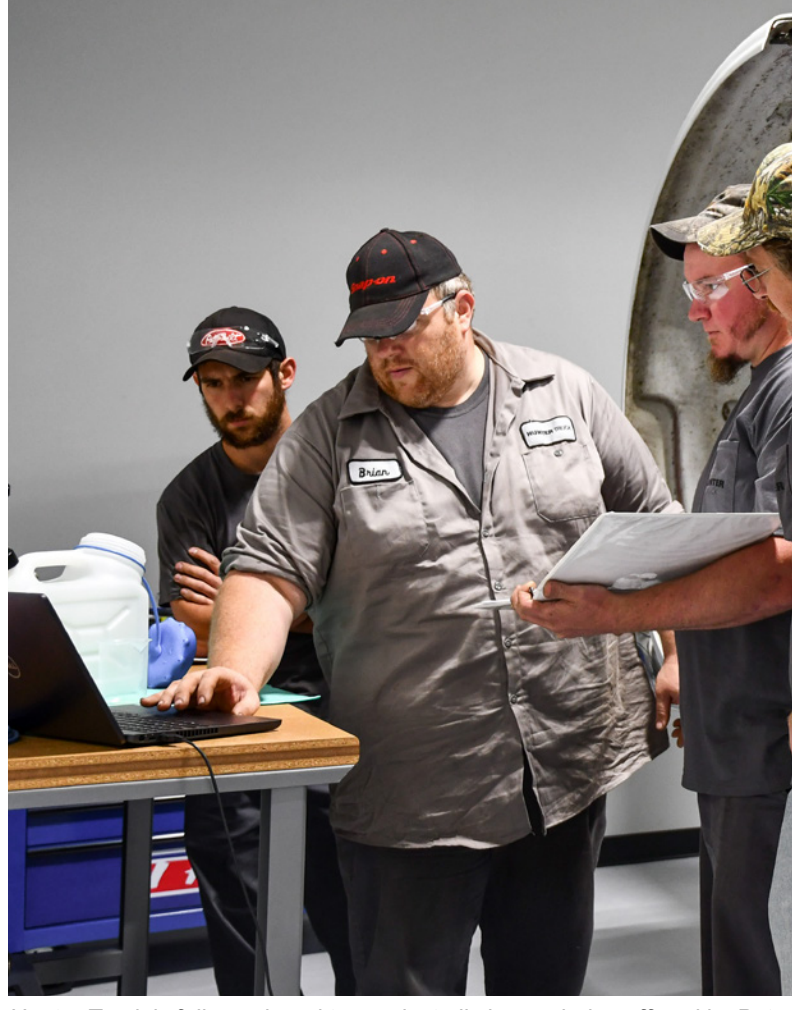
Hunter Truck is fully equipped to conduct all classes being offered by Peter

As you can see, Hunter Truck is fully equipped to conduct all classes being offered by Peterbilt and their suppliers. Hunter Truck provides/facilitates a wide variety of training, including PACCAR MX Engines classes; Peterbilt electrical classes, suspension, and HVAC courses; Bendix Air School; Con Met; Garage Gurus Heavy Duty Foundation Brakes; TRW Steering